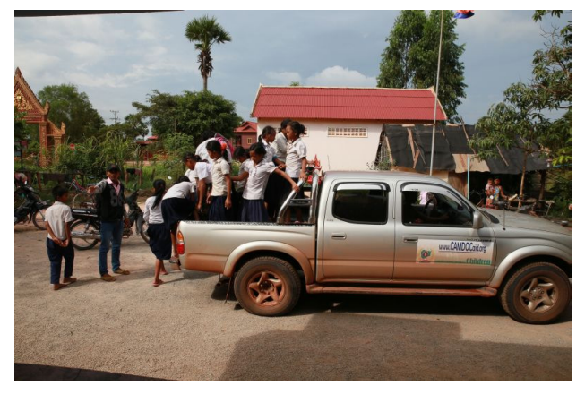
Those not possessing a bike were transported to the Health Center with the CAMDOC car.

The new pressure cooker of the Health Center could not be operated without danger for the operator and showed severe technical problems (model "Made in China", no spare parts). At last, we borrowed one from the AHC.