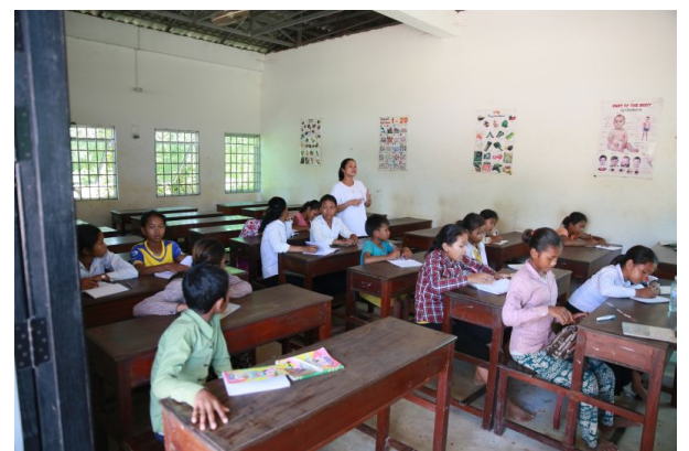
Sokchreb teaching English in the CTC

The new CTC, that opened its doors last year, is running well. Daily 6 English courses are offered at different levels. In total 228 students participated in 2015.