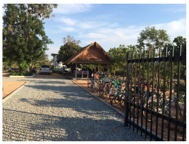
The new established Reading Hut at CTC CTC is very well frequented.

On request of the heads of the schools, our teachers also offer lessons to students in five primary schools in the community of Roeul, 6 hours per school per week. 540 students visit these entry level English classes.